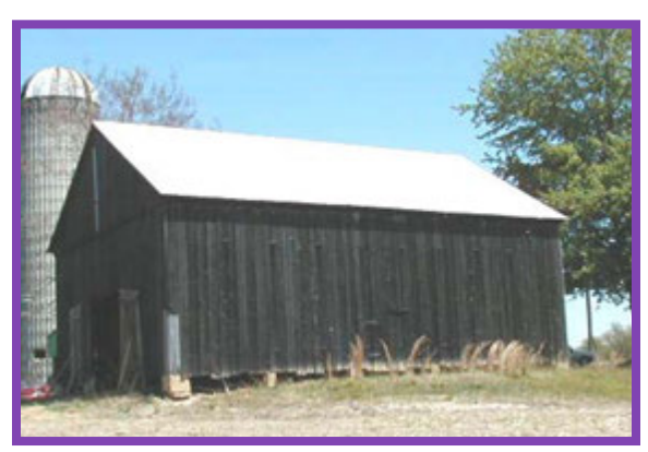
Tobacco barns are found throughout the subregion.