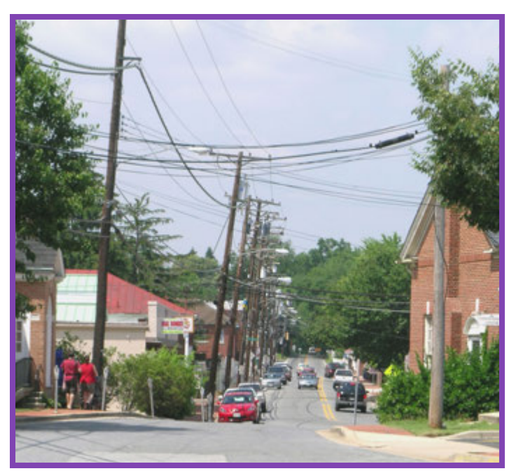
Main Street in the Town of Upper Marlboro.

alternatives for future land uses along US 301 and MD 725 were discussed, as well as the impacts of the various alternatives consisting of commercial and mixed-use development on the east and west sides of US 301. As discussed in the Subregion 6 Transportation chapter, future plans for MD 202 and US 301 include a realignment of these highways through this area as road upgrades occur. This realignment requires careful planning for new development opportunities that support the improved road system while taking advantage of the area's strategic location at the entrance to the county seat and at the intersection of two major roadways. The plan includes recommendations to encourage development, redevelopment, and other improvements in close proximity to the US 301/MD 4 interchange that will provide new employment and appropriate retail and residential opportunities that will