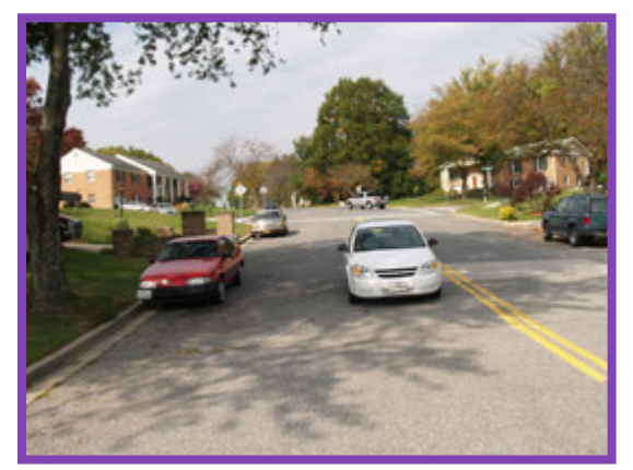
Residential street with parking on both curbs.