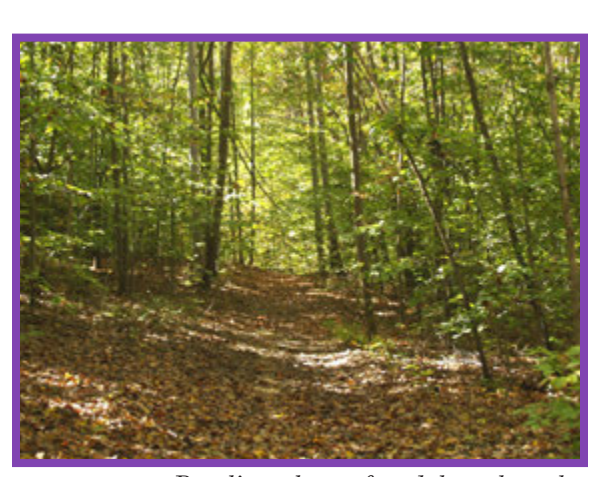
Bucolic paths are found throughout the subregion.