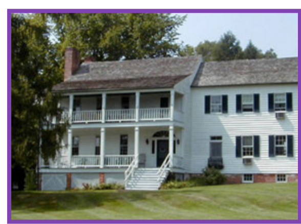
A National Register property in the Town of Upper Marlboro is an example of an early town dwelling associated with many prominent local families.

The vision and action plan recommends that new development on the western edge of town consist of housing to strengthen the area's residential character. In some cases, properties are landlocked and new road construction is necessary to provide access. The connection of Brown Station Road with