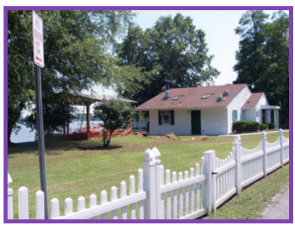
The community center is the focal point for community life in the Town of Eagle Harbor. Every summer Eagle Harbor Day is celebrated here.