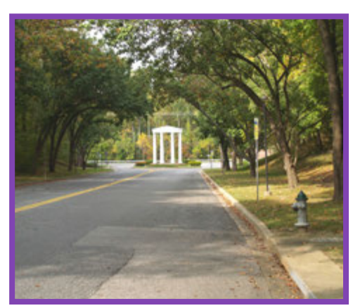
The entrance feature to the planned community of Marlton.