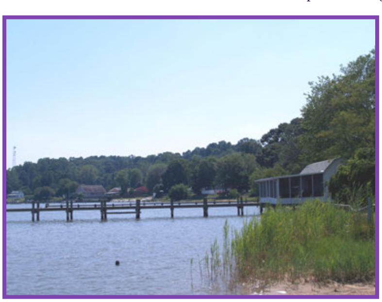
Fishing piers add to the ambiance in Eagle Harbor.