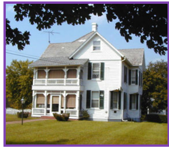
The Traband House, built in the 1890's in the Town of Upper Marlboro is a good example of late Victorian architecture.

Upper Marlboro began as a tobacco port town along the banks of the Western Branch of the Patuxent River when it was a much larger, less silted, and navigable body of water. Like most historic communities, Upper Marlboro has evolved since it was first created in the eighteenth century, although its function as a government center has endured. In the mid- to late-twentieth-century the town core saw major changes, including multiple tear-downs, modern construction, and severe alterations to existing historic resources. These changes have impacted the town's historic character to the degree that the overall architectural integrity of the town has been compromised. Upper Marlboro may no longer retain enough historic fabric to qualify as a local or National Register of Historic