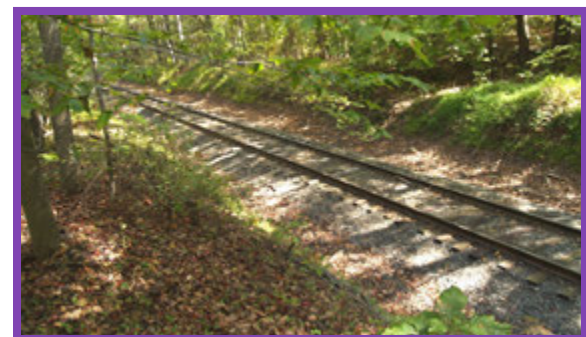
Freight railroad tracks crisscross the subregion.

The Marlton area is currently characterized by well-established residential neighborhoods. However, some of these neighborhoods are disconnected from one another. Marlton's civic core and the Marlton Community Park are inaccessible to southern Marlton residents by foot or bicycle. The railroad tracks and Marlton golf course are two physical barriers that force residents to drive even within their community. The following policies and strategies will address these concerns and try to implement the vision for Marlton.