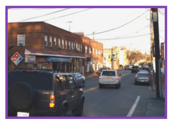
Some commercial buildings in the commercial core of the Town of Upper Marlboro.