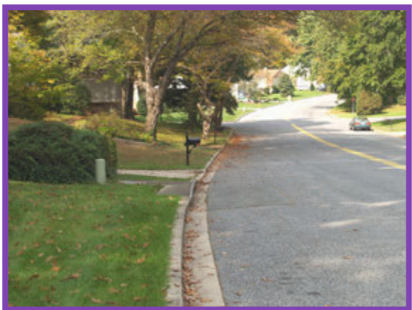
Some neighborhoods lack proper pedestrian linkages such as sidewalks.